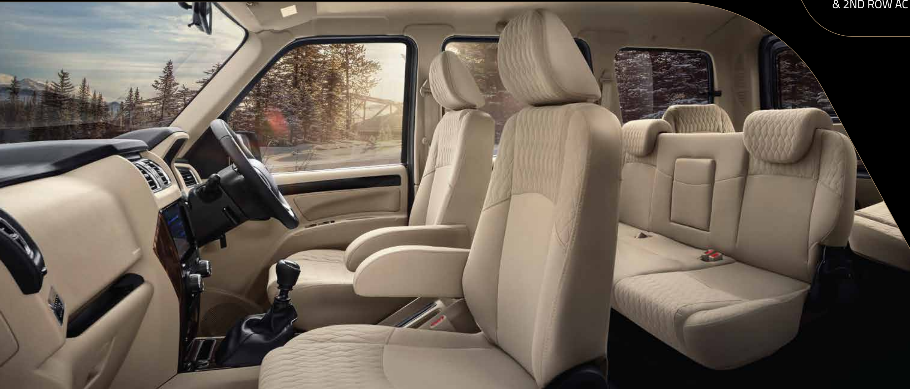
FULLY AUTOMATIC TEMPERATURE CONTROL & 2ND ROW AC VENTS